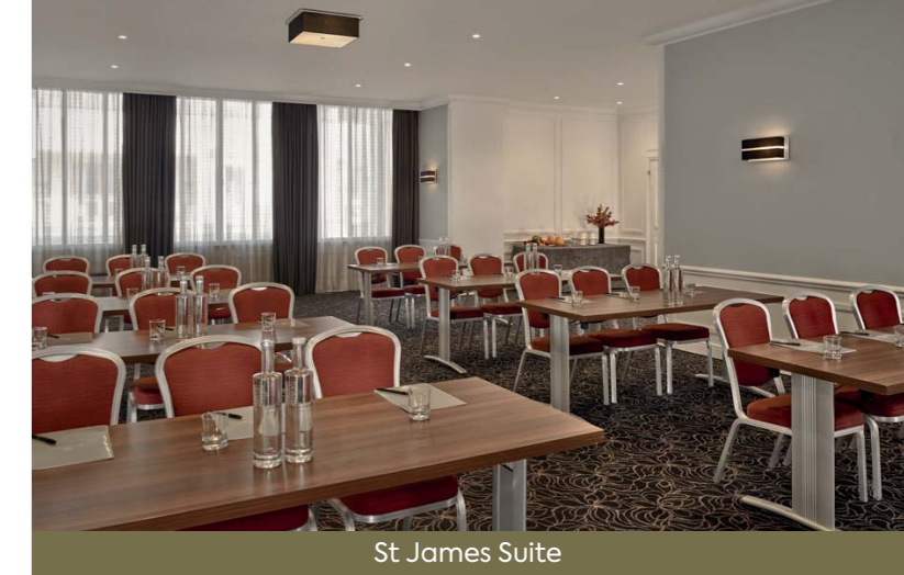
St James Suite