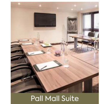
Pall Mall Suite