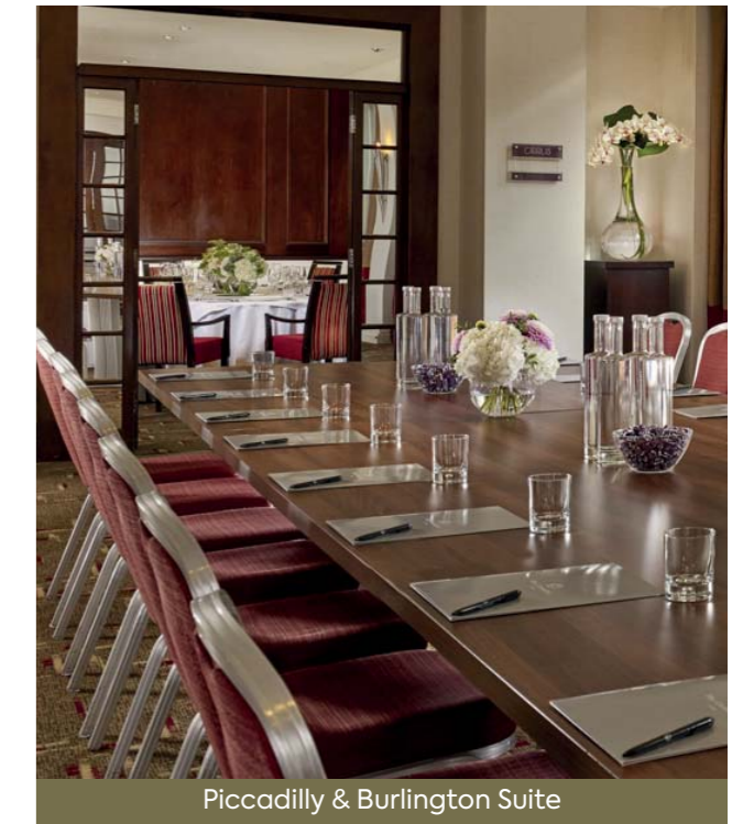
Piccadilly & Burlington Suite