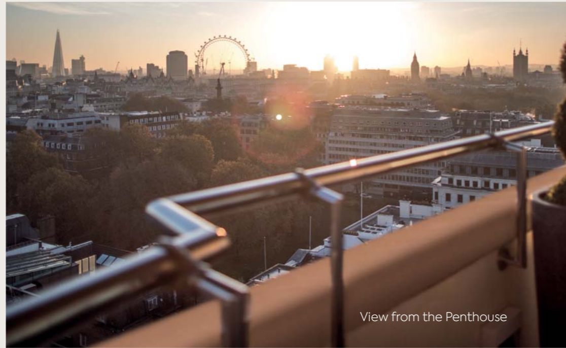
View from the Penthouse